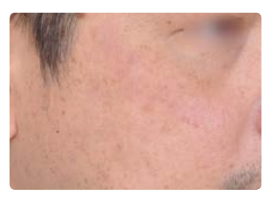
Pictures of Asian patient, before and 8 days after only one session with the new Moveo PL handpice.